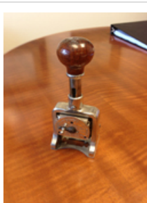
A 1891 Bates Automatic Numbering-Machine: Good as new.

If you see any inaccuracy in any article in The Texas Lawbook , please contact us . Our goal is content that is 100% true and accurate. Thank you.